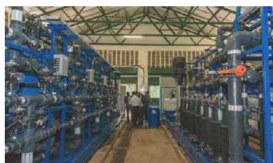
Two Rivers Mall Development, Ruaka, Kiambu County.

SIZE: 100,000 Litres per Hour Reverse Osmosis water