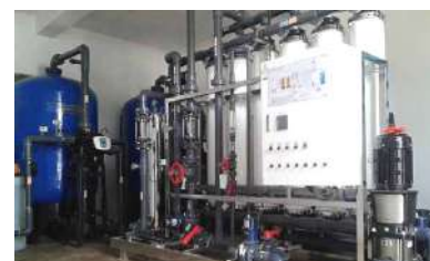
JTE Dam water project, Kiambaa, Kiambu County.

SIZE: 100,000 Litres per Hour Reverse Osmosis water