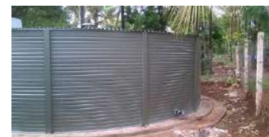
Community water tank, Kilifi County. Size: 110m 3 Pioneer tank.