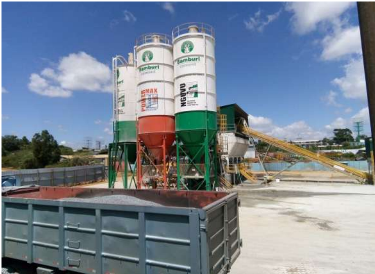
Bamburi Cement Plant in Two Rivers

Two Rivers Mall under its licensed water company (Two Rivers Water & Sanitation Company) has been selling treated wastewater to Bamburi Cement since September 2017. Bamburi cement uses the water for batching concrete which is sold to construction sites. The facility utilizes 1,000 m 3 of water per month and the treated wastewater retails at kshs. 150 per m 3 . The wastewater treatment plant is among others one of the water plants installed and run by CESP Africa until when it sold it to Two Rivers.