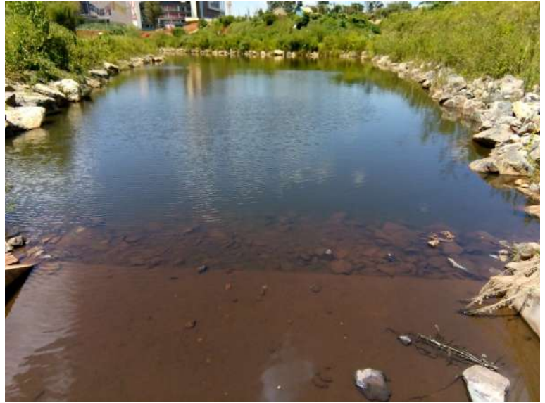
A dammed section of River Ruaka