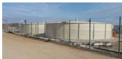
AFEX Kenya Limited - Tullow Oil Kapese Camp. Size: 250m 3 and (2x)480m 3 water storage tanks.

Size: 25m 3 Ultra Filtration water purification system.